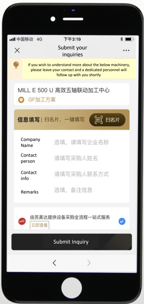
Consumer inquiry page