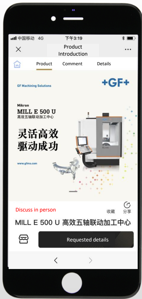
Product HD picture for display

If the customer is interested in learning more about the machines, they will submit an inquiry and a dedicated SUMEC personnel will follow up with the request.