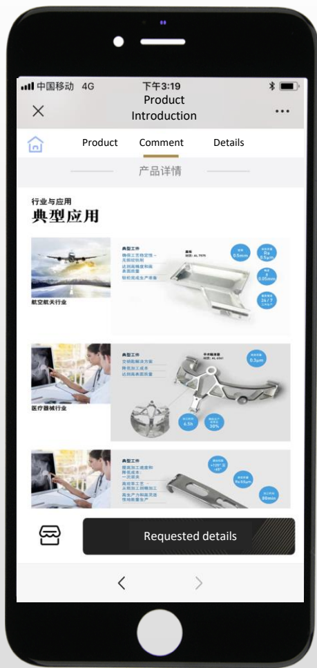
Detailed machinery information